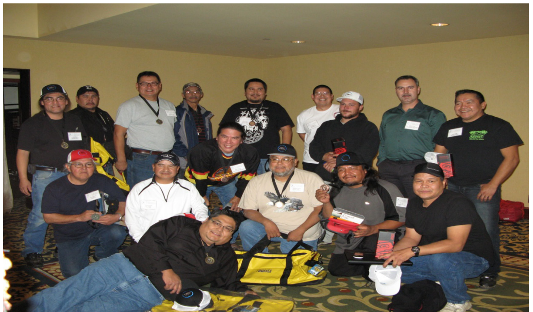
A few of our BC Operators:

There have been a few unexpected emergency situations this past summer in BC due to the drought conditions that the province has faced. Some of these situations have had easy fixes with leak detection and repair being all that was necessary to help recover the system all the way to the possibility of losing the entire water source. Throughout all of these situations the Circuit Rider Trainers have all stepped up and provided their expertise and troubleshooting abilities to help support each community through their struggles. In many cases their presence has been able to calm the situation in the communities as well as helping to empower the Operators in their knowledge and ability. BC Region will be using these differing situations to help each of the communities facing emergency drought conditions create a proper drought management section in their community emergency response plan.