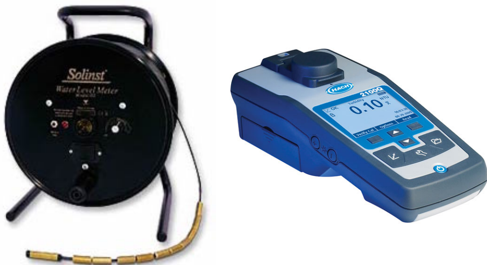
Figure 5 – Specialized tools provided and used in groundwater and wells April Workshop 2015