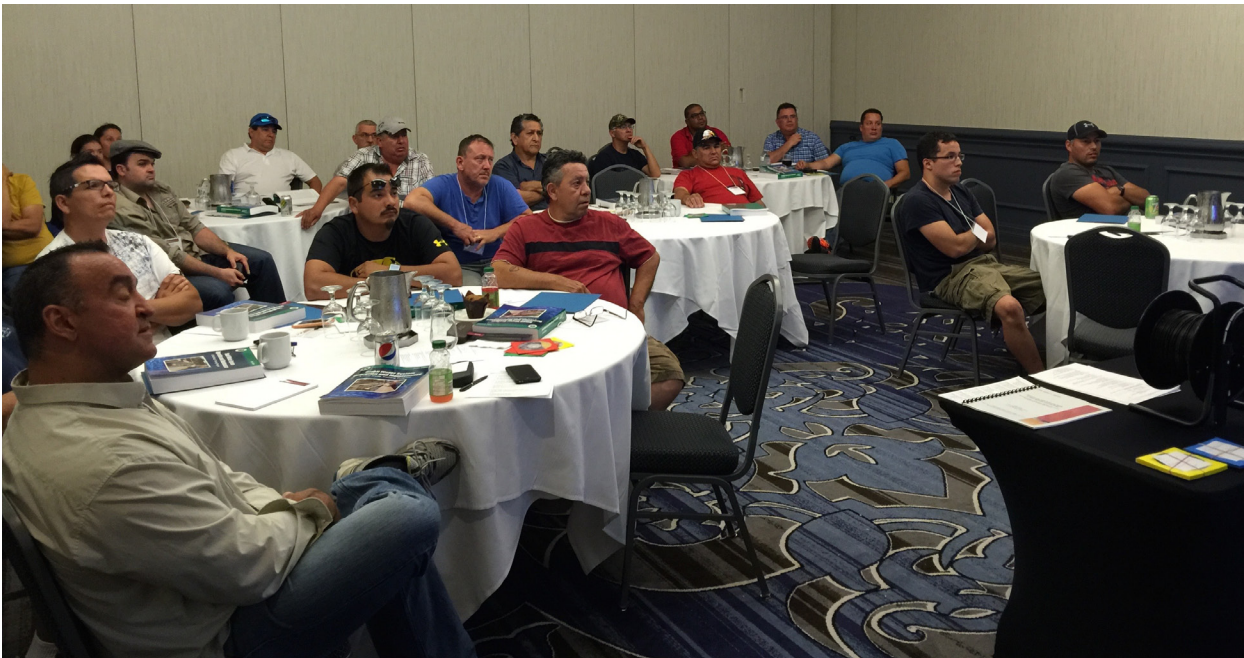
Figure 2 – Groundwater and Wells and Turbidity workshop July 2015

North Shore Micmac District Council-CRTP has a staff of six full time dedicated individuals providing CRTP services: a program manager, program co-ordinator, plus four experienced provincially certified trainers with one designated as senior trainer. The CRTP in the Atlantic region has made over 300 site visits over the past year and is expected to do the same this year in 2015-2016. The average number of site visits per year per community across the region is 16 with some communities receiving more visits than the average due to priority issues. All contacts with the communities are captured by reporting which includes site training visits, telephone contacts, emergency responses, participation in the regional AANDC annual inspections and capital project planning process. We continue to support drinking water and wastewater systems operation and training on site as part of our mandate in 2015-2016 balancing these efforts through a series of two day workshops held over the year (typical 3 workshops in a calendar year). Classroom training to operators in 2015 currently have received instruction and information on “Lift Station” (Operation/Maintenance), “Groundwater and Wells” (Operation Basics), plus “Turbidity” (Importance/Measurement) and this fall will receive instruction on “Disinfection Concepts and Practises” and “Water Storage” (Operation/Maintenance) while assisting operators in their preparation for certification.