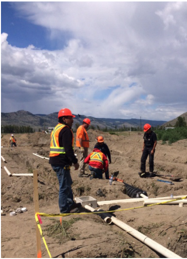
Certified Septic Installers Course