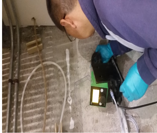
Operator installing a new diaphragm